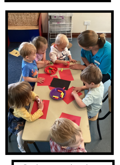
Exploring with colours and marks.