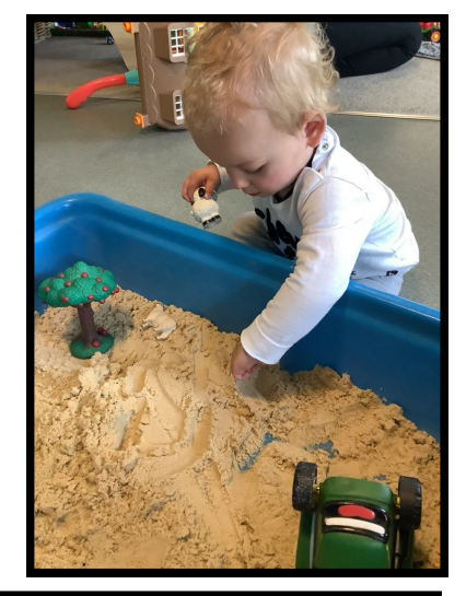
Exploring the sand.