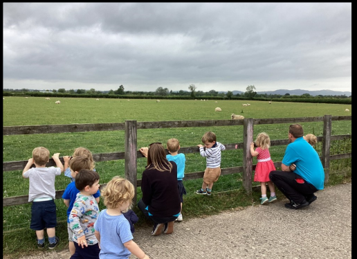
A visit to the sheep field.