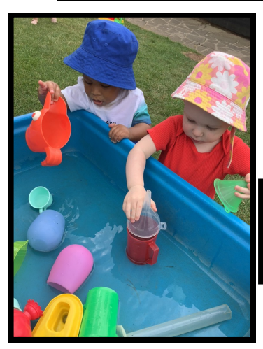
Water play fun in the garden.