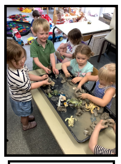
Exploring the Rock Pool and Tea bag sensory trays.