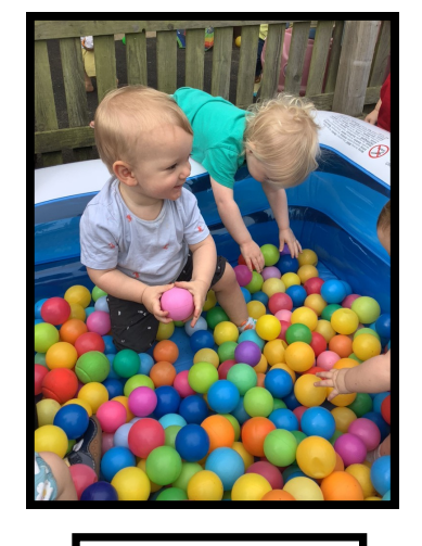
Ball Pool Fun!