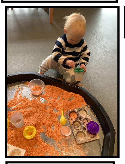
Scooping up and filling containers.