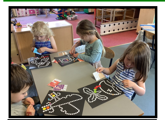
Sticker creative pictures.