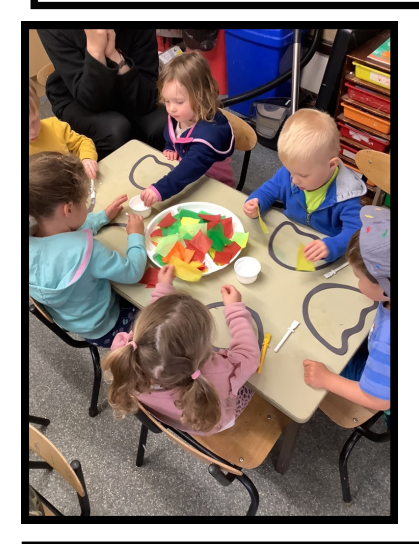
Creating Jelly Fish Sun Catchers.