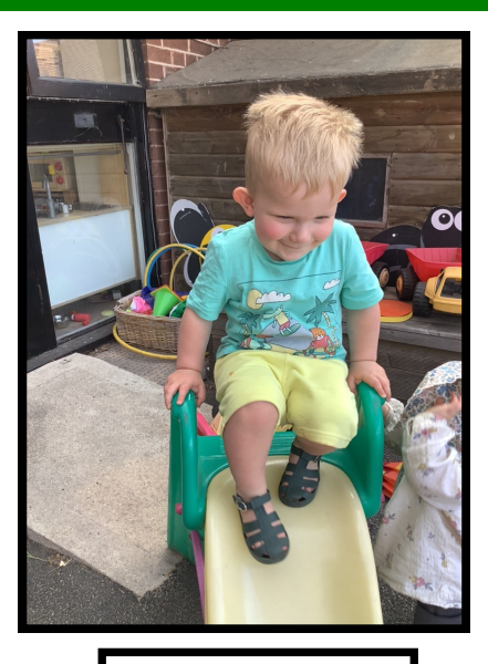
Having fun on the slide.