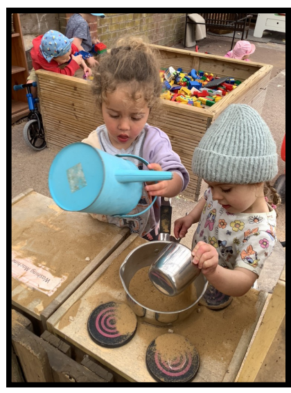
Cooking up some tasty treats together!