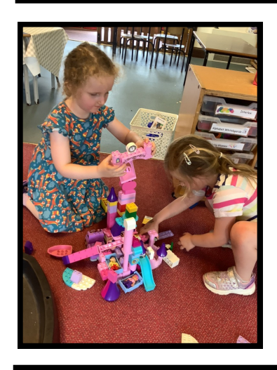
Using our imaginations to be creative together.