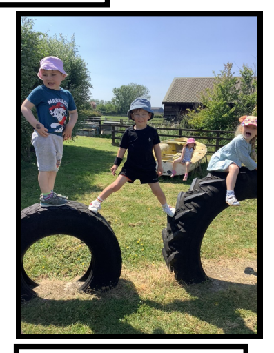
Look at us!