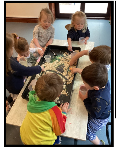
Emptying and filling containers.