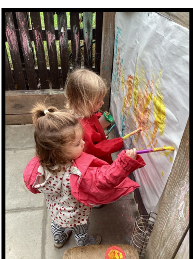
Getting creative with paints.