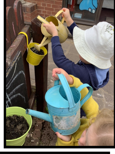
Planting seeds and watering them.