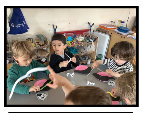
Making Pirate masks for Pirate Day!