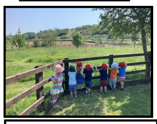
Lots of excitement when we spotted a tractor in the field.