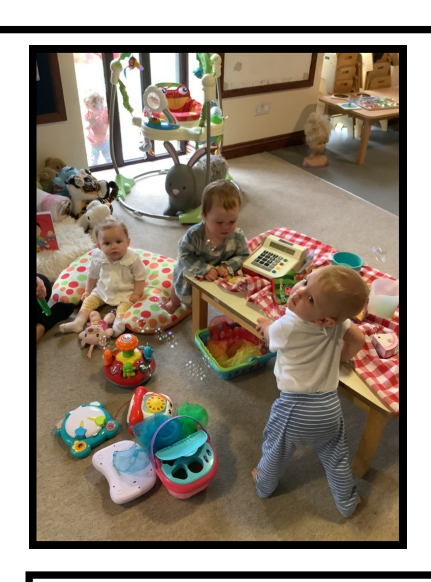
Enjoying shop role play.