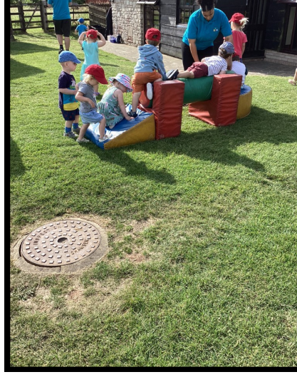
Practising our balancing,