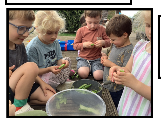
Podding our Broad Beans.