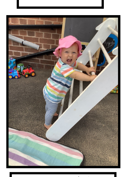
Having a go at climbing.