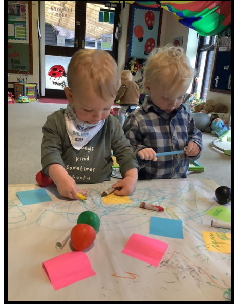
Mark making with a variety of resources