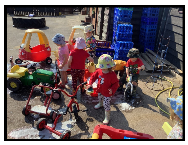
Having fun washing the trikes and cars.