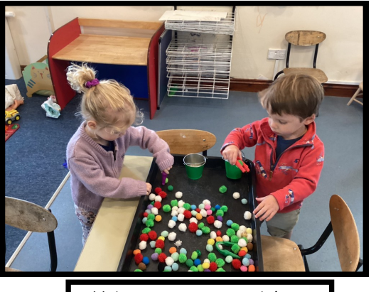
Using tweezers to pick up the Pom Poms.