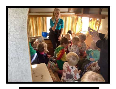
Singing songs in the Caravan.