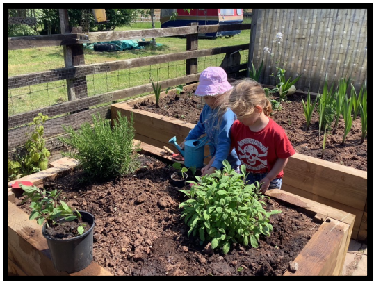
Planting and watering our Nursery garden.