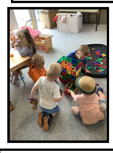
Building Structures together.